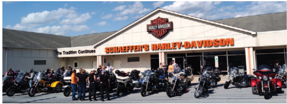
From Iron Valley in Manheim to Schaeffer's in Orwigsburg with 4 stops in between.